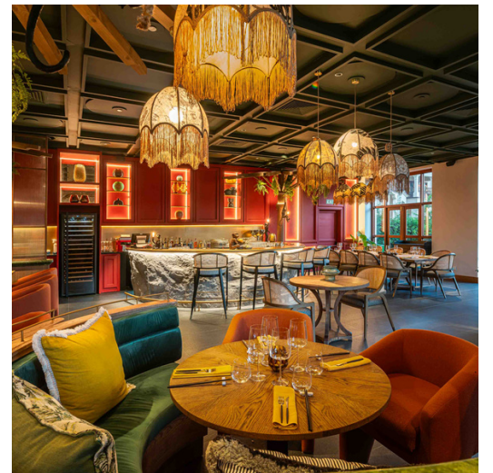
Ginger Thai Restaurant

Enjoy our new Indian dining experience with authentic dishes, from fragrant curries to tandoor specialties, whether indoors or under the stars at Kesari.