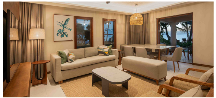
Beachfront Family Suite

Embark on a Tropical Escape at Hilton Mauritius - A Luxurious beachfront haven on the stunning west coast of Mauritius. Immerse in world-class amenities, serene white sandy beaches, and crystal-clear waters. Experience exquisite dining, revitalizing spa experiences, and thrilling non-motorized water sports. Discover stylish rooms and suites with select ocean views, perfect for unwinding in paradise. Your dream tropical getaway awaits.